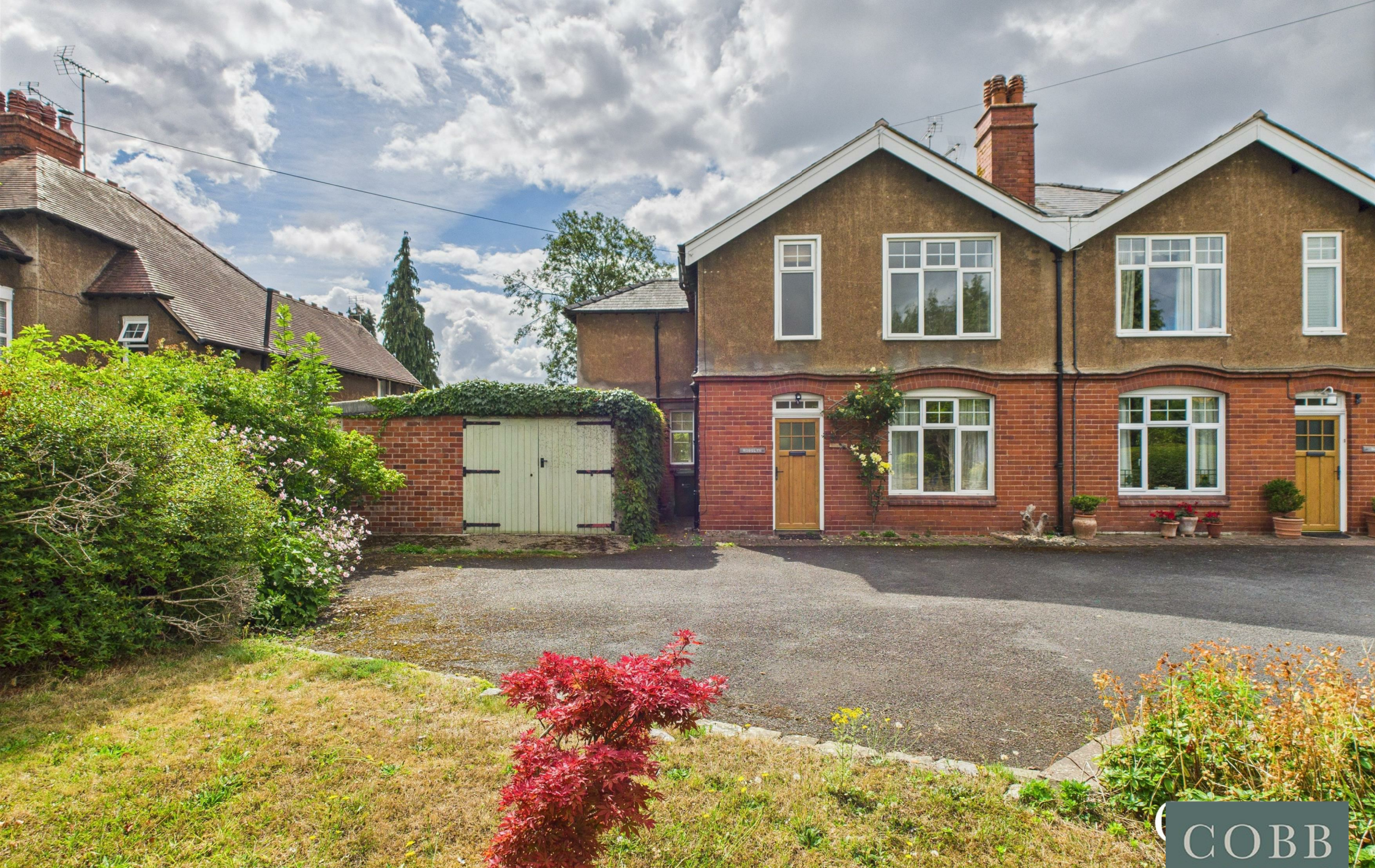
Rosslyn, Green Lane, Leominster, HR6 8QN Price £350,000